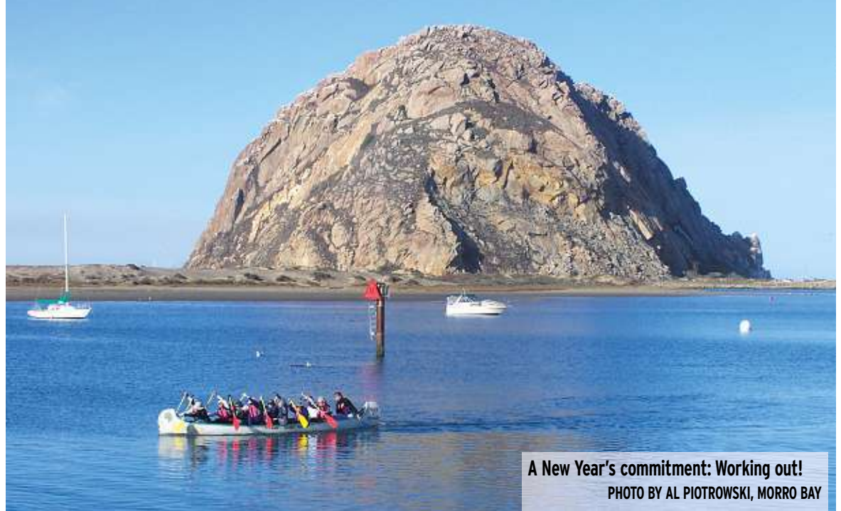
A New Year's commitment: Working out!

See more Classified Snapshots online at SanLuisObispo.com/photos SNAPSHOTS FROM SLO COUNTY